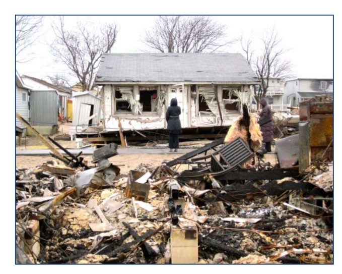
Hurricane Sandy - Breezy Point, NY

ATSDR's Geospatial Research, Analysis & Services Program (GRASP) created databases to help emergency response planners and public health officials identify and map communities that will most likely need support before, during, and after a hazardous event.